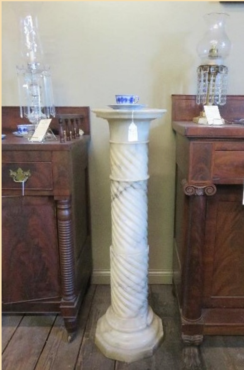
Late 19th Century Marble Pedestal —Beautiful grey and white hand-carved Italian marble pedestal with heavy center rod construction. This 47-inch tall

RFTC has recently added some excellent new items to its carefully curated inventory. Some highlights include a marble pedestal, porcelain recording scale, and walnut corner cupboard. For questions about items pictured below, please contact us at 515-809-1715 or raccoonforks@gmail.com .